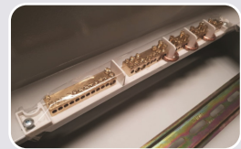
Earth & Neutral