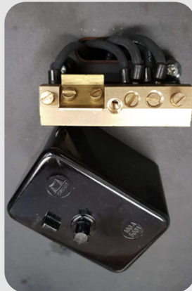
Meter Neutral Link