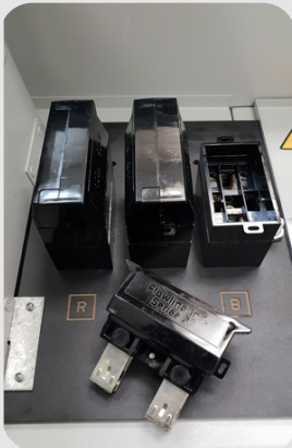
SPCD/Meter Fuse Holders