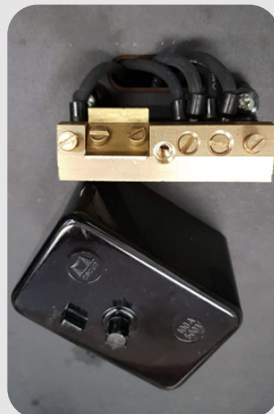
Meter Neutral Link