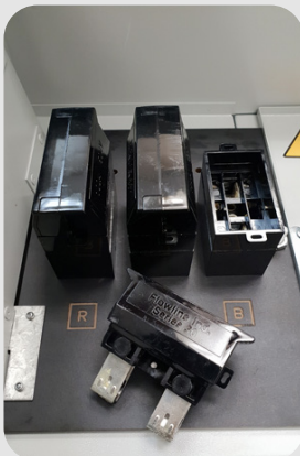
SPCD/Meter Fuse Holders